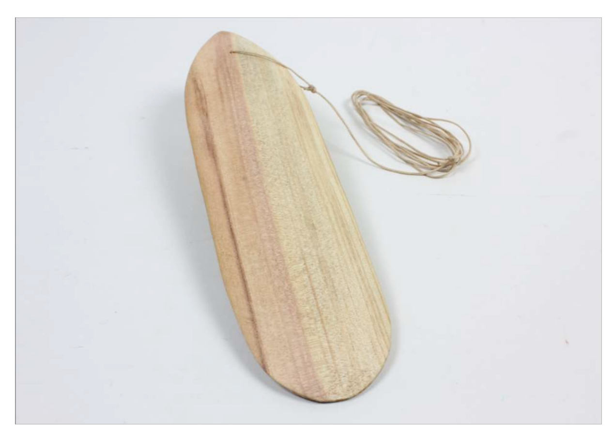
Fig. 7. Questions for Activity 4.

1. Hvad er det, og hvor hører genstandene til? f.eks. rum, sted, område. 2. Har nogen af jer brugt eller set en eller flere af genstandene før? 3. Hvilken af de 3 genstande har størst værdi? Hvorfor?