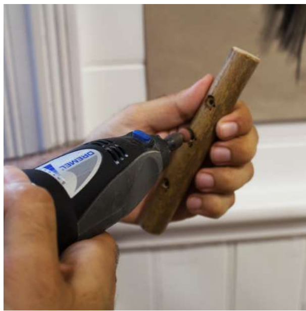
Fig. 3. Making the kōauau , Māori flute, at Jo'el Komene's workshop.